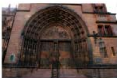
The Church of the Holy Trinity is tucked in the middle of the block of 88th Street between First and Second Avenues. With concerts, classes, a small homeless shelter and a thrift store, it's one of the Upper East Side's hidden gems.