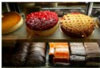
Eschew all other pastries at Andre's Café and European Bakery for the many varieties of flaky strudel.