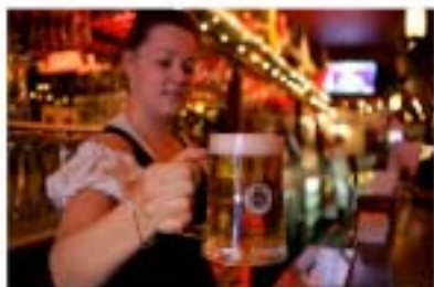
At Heidelberg Restaurant, the waitstaff wear traditional garb and beer takes at least seven minutes to pour properly.

From the New York Times: Local Stop | Yorkville