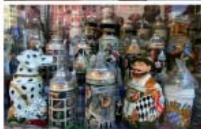
The window at Schaller & Weber, a German butcher and grocery, displays souvenir steins.