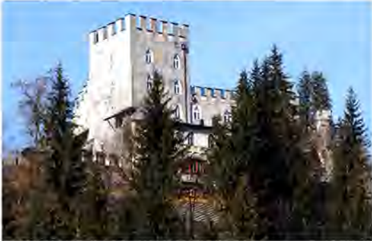
Itter Castle is a small castle standing on a high knoll in Itter, a village in North Tyrol, 20 km west of Kitzbühel

The once mighty German war machine was in shambles. April 31, 1945 “the leader” was dead; and, without orders from above, military units in what was left of “Das Reich,” were on their own. This was the backdrop of a clash between two German officers in which one would come out a hero; the other, a “Schurke” (villain).