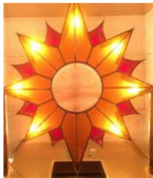
Jesus, Mary and Joseph pray for us!