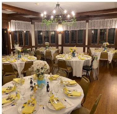
KOH Dining Room

The K-88 ballroom is spacious, elegant and affordable!