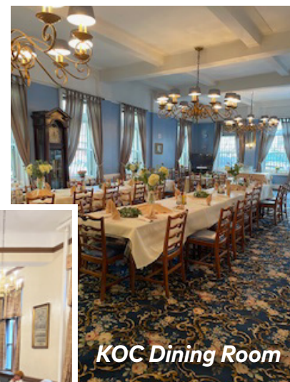
KOC Dining Room