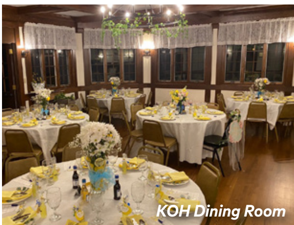
KOH Dining Room

Please call 212 360 6022 or email bfox@germansocietyny.org .