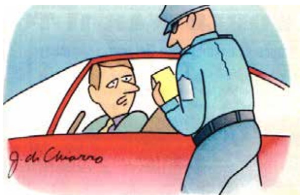
"Well, if I was speeding, Officer, so were you."