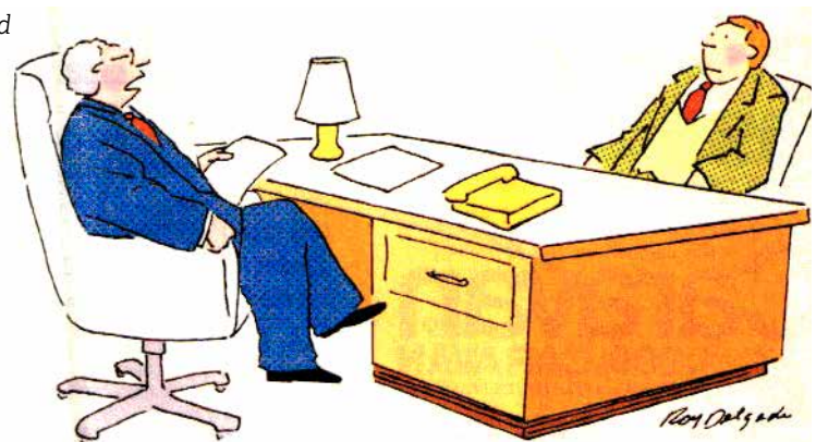
"You can't please all of the people all of the time, but I suggest you start with me."