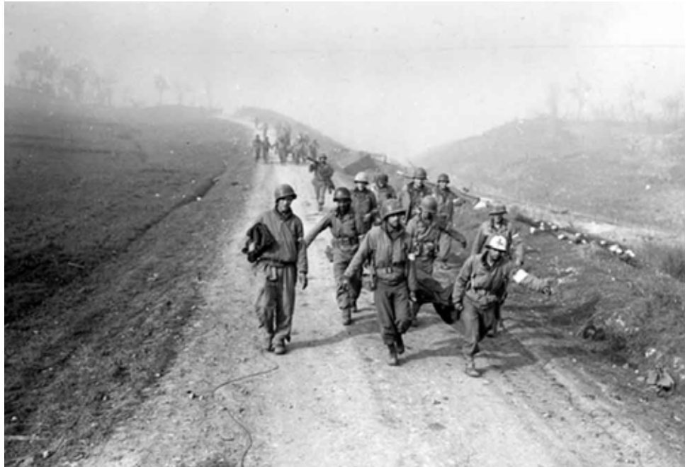
Part of the Battle of Monte Cassino, Italian Campaign: American soldiers bring back wounded during the attempt to span the Gari river near Cassino, Italy, January 1944.

Each of those attempts made by the Allies was a failed attack resulting in a miserable loss of Allied life. Over half of the 4,000 Americans employed in the Crossings were killed or wounded, while the Germans suffered 64 deaths and 179 wounded. Henceforth, General Clark was known as “Mark the Butcher”.