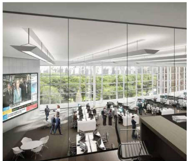
One Columbus Circle Trading Floor

The combination of the thriving Upper West Side combined with the European feel of Central Park—near a river and cosmopolitan tempo—enthralled the Deutsch Bankers. Not too far a cry from early New York when the German Astor brothers became outstanding bankers here.