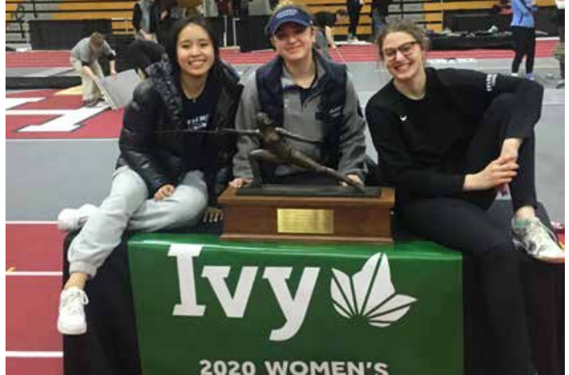
Columbia University Women's Foil Team at the Ivy Championship

SOURCE: Nielsen, Rakuten Intelligence