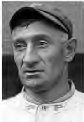
| Wagner with the Pirates in 1903 |

Honus Wagner is probably better known for his baseball card, which is more valuable than anybody else's because of its rarity. But his career was better than any other shortstop in big-league history, too.