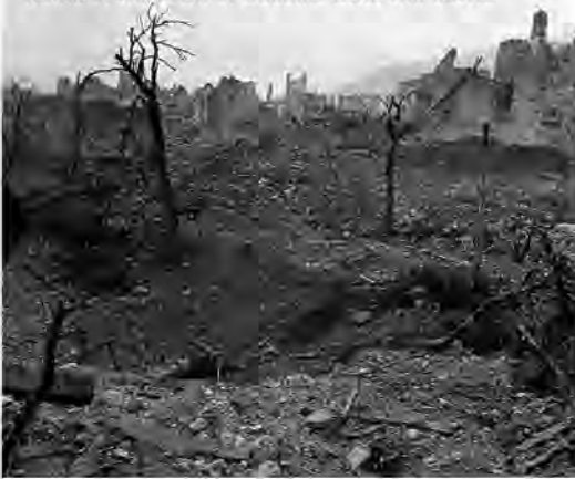
Ruins of the town of Cassino after the battle

If a critique of the conduct of World War II was made, the axis, with their brutality and inhumanity, would come off very badly. This does not mean, however, their adversary, the allies, were without fault. Take the case of the bombing of the monastery at Monte Cassino during the Italian campaign.