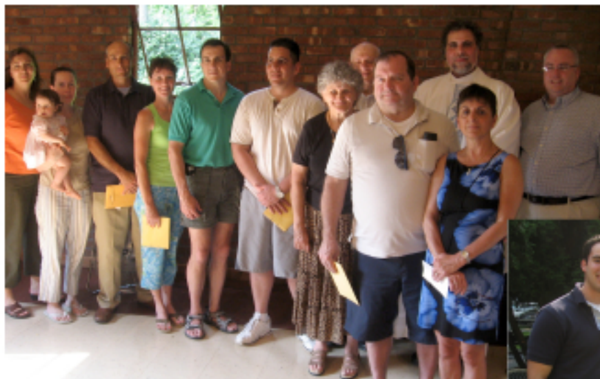
New members initiated on Father's Day