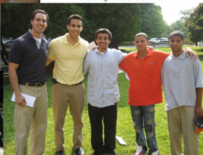
Eight scholarships were presented to the Nativity Mission School