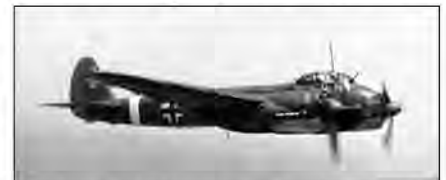
Junkers Ju 88, the aircraft employed in the raid.

There was no ships manifest and the crew of the Harvey had been killed. The condition of the survivors of the blast dumbfounded the hospitals and aid stations with their grotesque lesions and respiratory symptoms. The yellowish ooze from the charred wounds gave the gas its name "mustard gas". It had been used in World War I; the allies explained, later, it was to be a retaliatory weapon if the Axis used it first. The actual number of deaths, injuries to civilians and military and damage to the ecology has never been estimated. It serves as a reminder of man's inhumanity to man.