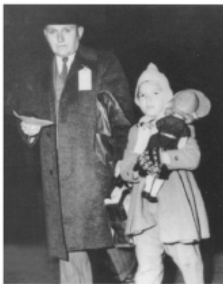
During WWII the U.S. Government interned 15,000 German-American civilians, including citizens and 4,058 Latin-American Germans brought here and later exchanged for Nazi-held Americans.

The devastating attack on Pearl Harbor, on December 7, 1941, shocked American conscience. Up to that time, the average American wistfully hoped that America could remain neutral.