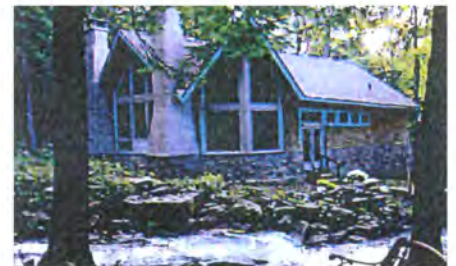
One of a kind chapel