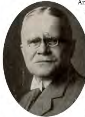
Dr. Paul Theodor Uhlenhuth

Americans may not be addicted to crime stories; but, judging by television listings, they certainly have a strong interest in the subject. Some of these popular T.V. shows are C.S.I. , Forensic Files , Nancy Grace , Date Line , The New Detectives , etc.