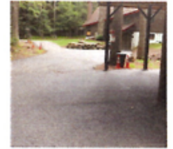
New Asphalt Paving