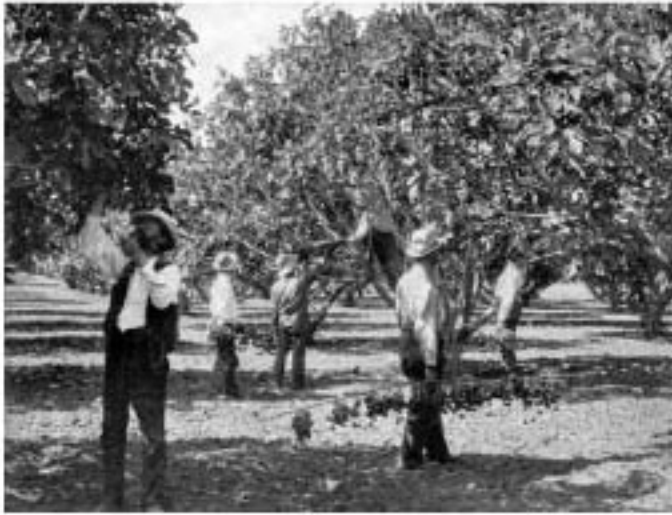
Distributing Insect-laden Figs in a Smyrna Fig Orchard in order to fertilize the flowers.