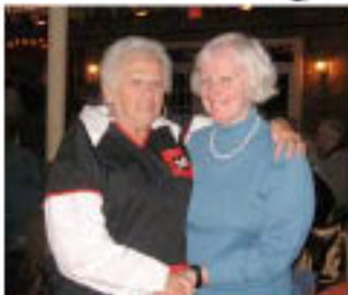
Photo Gallery: KOH Closeout Party