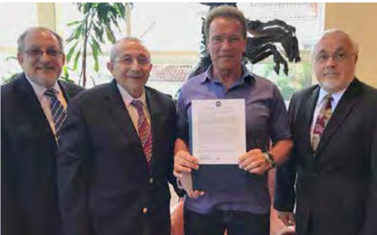
The Simon Wiesenthal Center commends Arnold Schwarzenegger for his generous gift to support the Center's work fighting hate, bigotry and anti-Semitism.

Action star and ex-politician Arnold Schwarzenegger is a real-life hero! In response to the violent protesters who terrorized Charlottesville, Va., the "Total Recall" actor is donating $100,000 to the Simon Wiesenthal Center. The anti-hate organization, named for Holocaust survivor and Nazi hunter Wiesenthal, is an international human rights charity dedicated to "repairing the world."