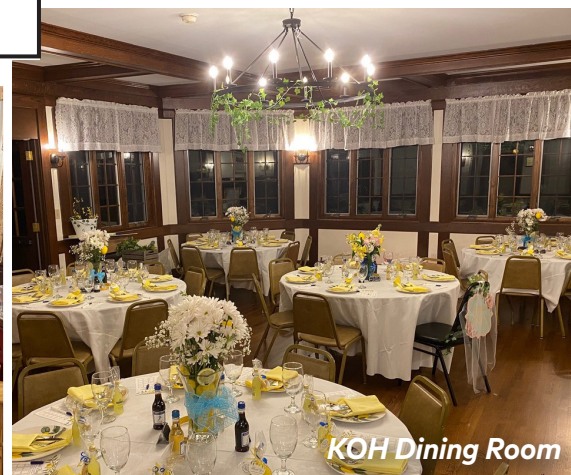
KOH Dining Room